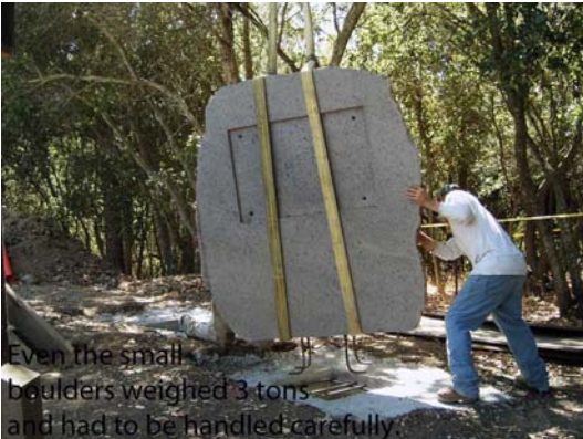
Even the small boulders weighed 3 tons and had to be handled carefully.

After two years of planning and waiting, the Chanate Historic Cemetery's 'monument to the dead' was installed in September. The monument consists of three huge boulders (the largest weighs over five tons) holding four cast bronze plaques with the names of those buried in the old county cemetery. A total of 1,328 names are commemorated on the plaques, providing recognition for