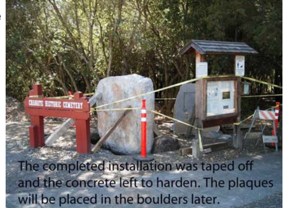
The completed installation was taped off and the concrete left to harden. The plaques will be placed in the boulders later.

the mostly unidentified graves. A memorial service of dedication will be scheduled for Spring 2012.